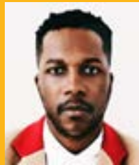
Leslie Odom, Jr. Multifaceted Tony and Grammy Award-winning performer